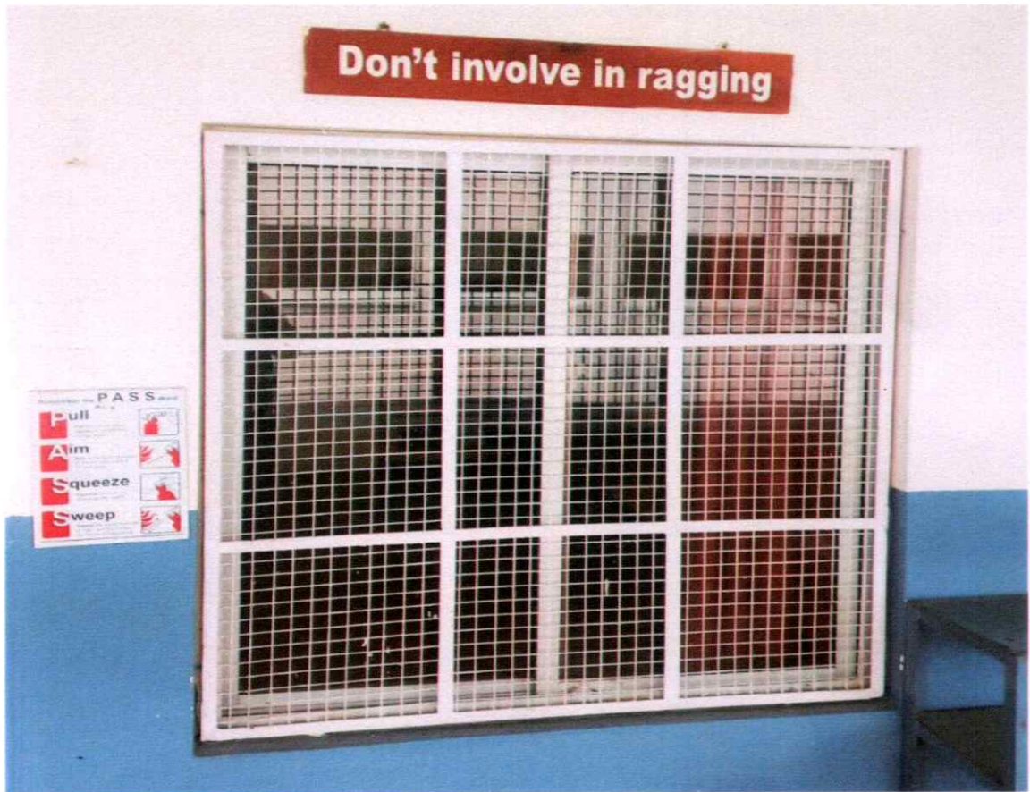
Awareness Board in Computer block:

Dr. D.K. Audikesavulu Marg (Bangalore-Tirupati Bye-pass Road), Murukambattu Post, CHITTOOR – 517 127