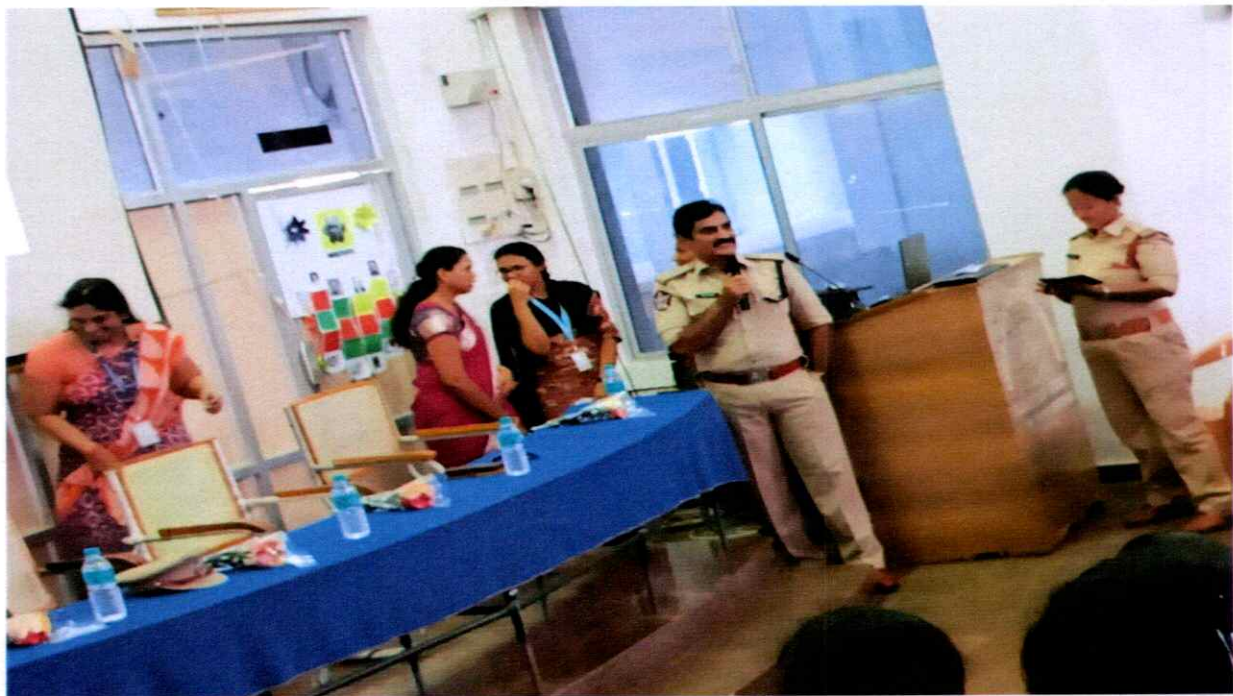
An awareness Program conducted by District police officers on sexual harassment and ragging on August 2023.