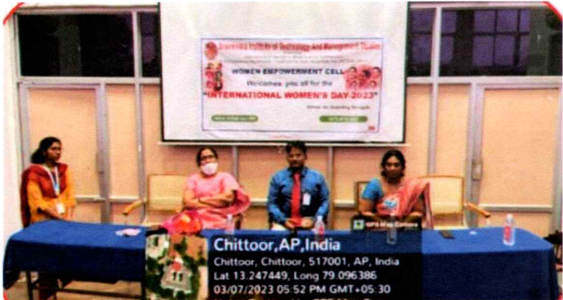
An awareness Program conducted on sexual harassment and ragging on March 7 th .

SITAMS NSS unit as organized various awareness programs on anti-ragging, Street corner meeting and rally campaign to create awareness among the students regarding anti-ragging.